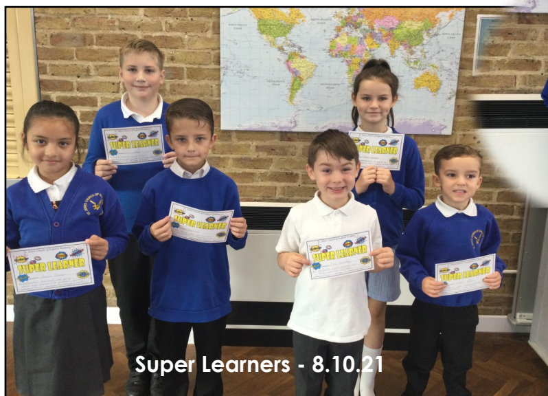
Super Learners - 8.10.21