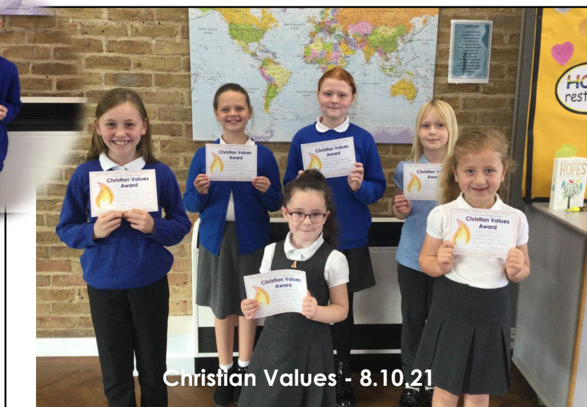
Christian Values - 8.10.21

We are delighted to inform you that there will be an Autumn Disco this year!