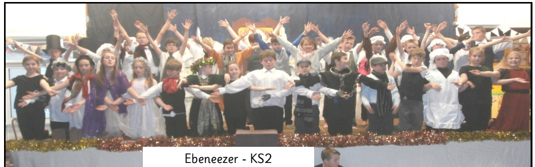
Ebenezer - KS2