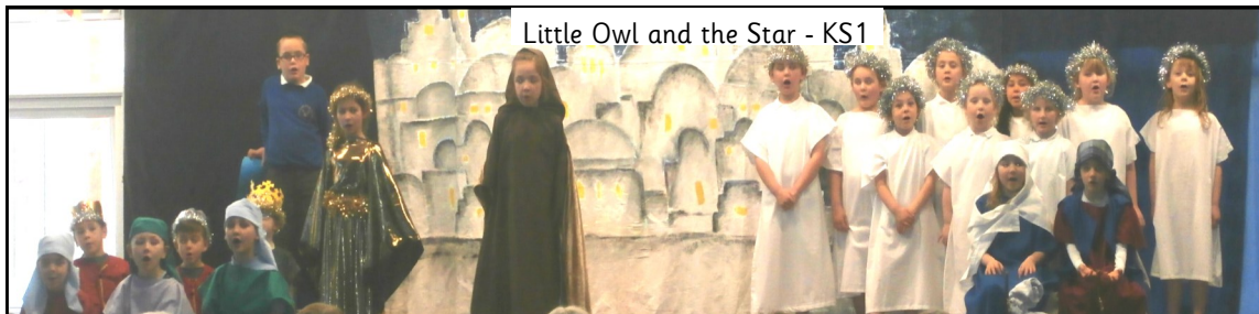
Little Owl and the Star - KS1